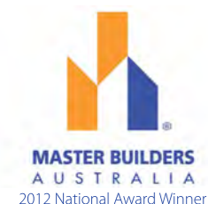
National Export Award for Edmonds Business

With strong synergies between insulation and ventilation in the building industry, Edmonds was acquired by CSR Building Products Limited in 2005. Its mission remains to create Technologies for a Sustainable Future.