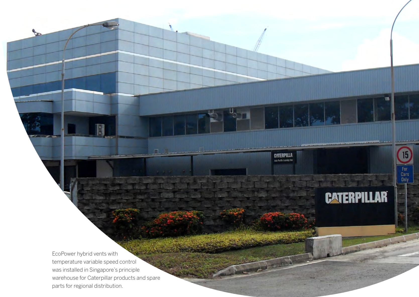
EcoPower hybrid vents with temperature variable speed control was installed in Singapore's principle warehouse for Caterpillar products and spare parts for regional distribution.