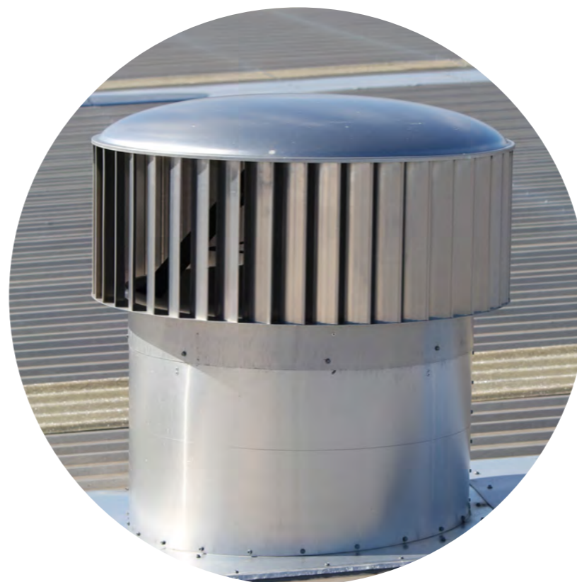
EcoPower installed at Edmonds Seven Hills, NSW, Australia.