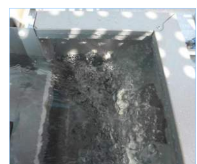
DB 200-1, Q = 16 l/s (box gutter slope - 1 in 200)