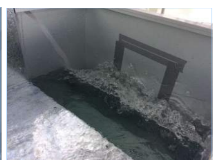
DB 600-1, Q = 16 l/s (box gutter slope - 1 in 200)